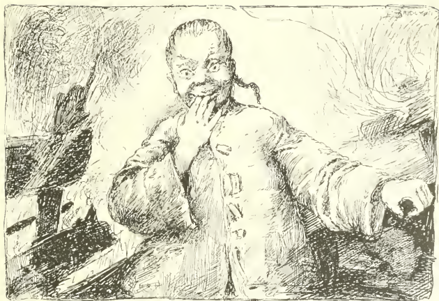
YE FIRST TASTE.